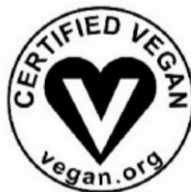
Certified Vegan Logo

Of course, one of the best ways to prevent the harmful side effects of free radicals is to avoid them. And that means eating a diet high in plant-based foods (to increase your intake of antioxidants which fight free radicals from the inside), avoiding sun exposure, and quitting harmful habits like smoking or excessive alcohol consumption.