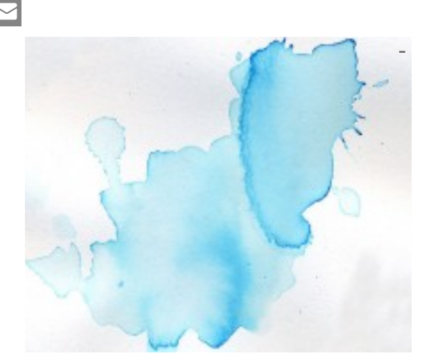
Remove Stains Naturally & Toxin-Free