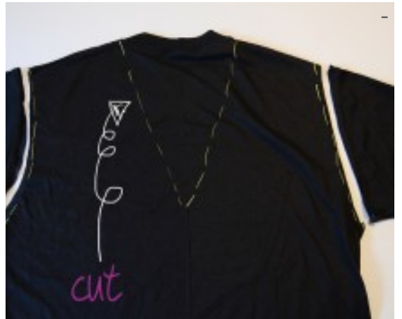
Upcycle Your Life