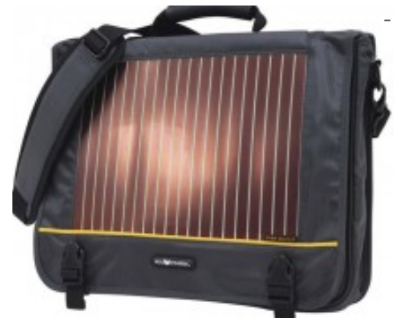
Go Solar with a Solar Handbag