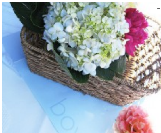
it might not be reflected in revenue or attendance or TV numbers