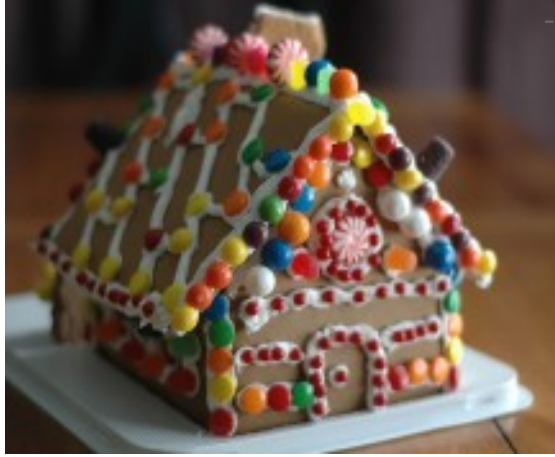
Upcycle Your Holidays, Help the Planet