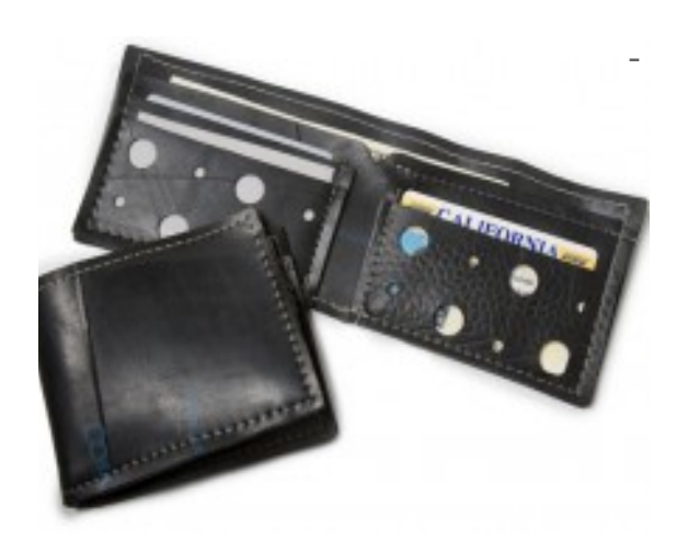
Fair Trade Father's Day