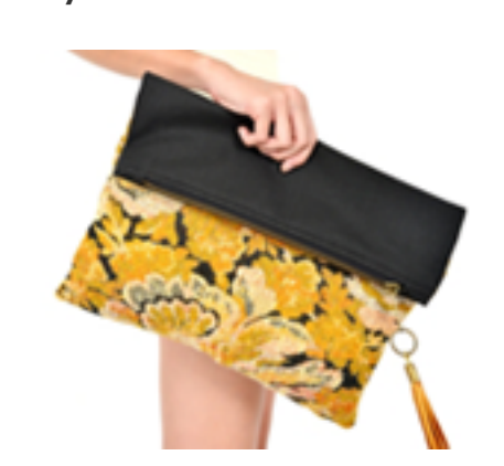
Shop all pretty in pastels