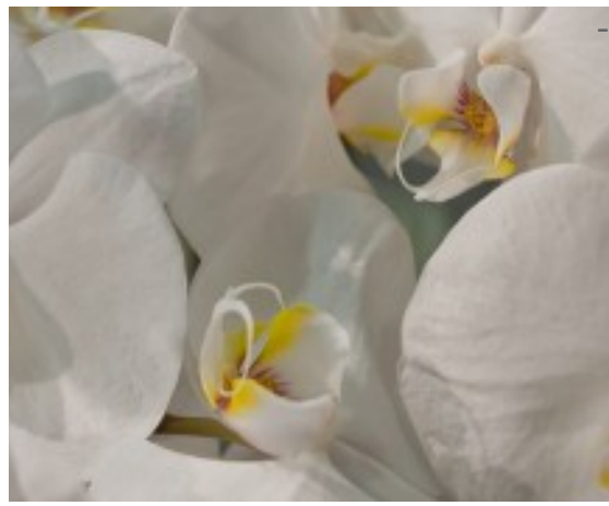
Fair Trade Flowers for Mother's Day