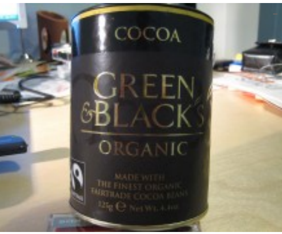
Give "Green" Chocolate this Valentine's Day