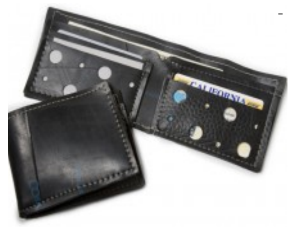
Fair Trade Father's Day