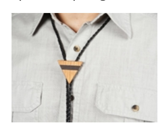
Shop all step into spring