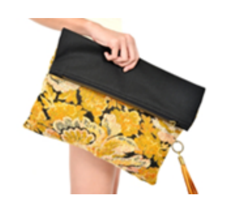
Shop all pretty in pastels