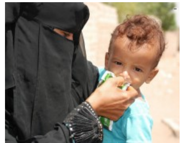
Help Solve Extreme Hunger