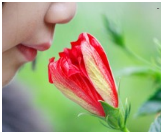
Rid Your Home of the Indoor Air Pollutants