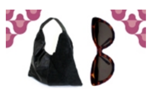
SHOP GLAMOUR SHOTS