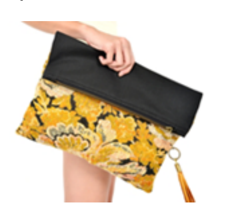
Shop all pretty in pastels