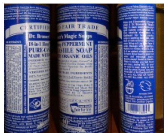
Recipes for Natural Powdered Laundry Detergent