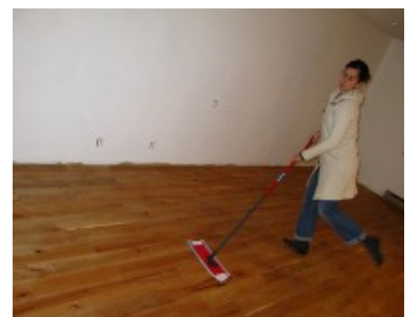
Natural Recipes for Wood Floor Cleaner