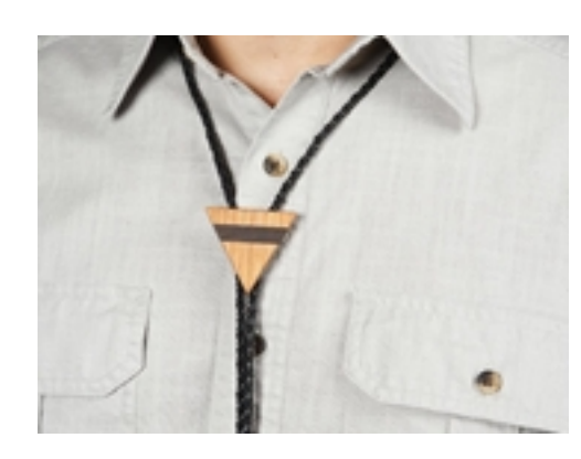
Shop all holiday picks of the week