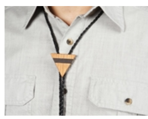
Shop all holiday picks of the week