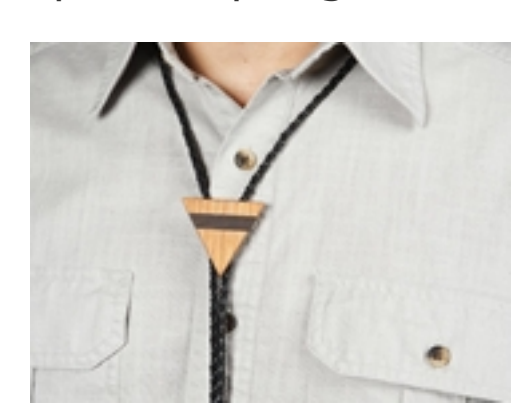
Shop all step into spring