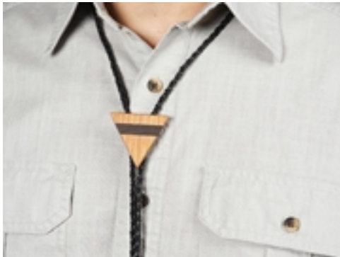
Shop all step into spring