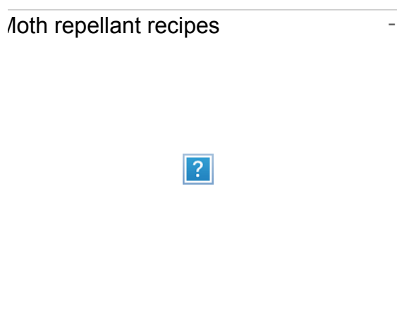
Natural Moth Repellent Recipes