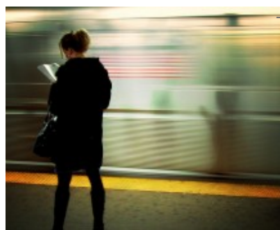
Increase Productivity, Use Public Transportation