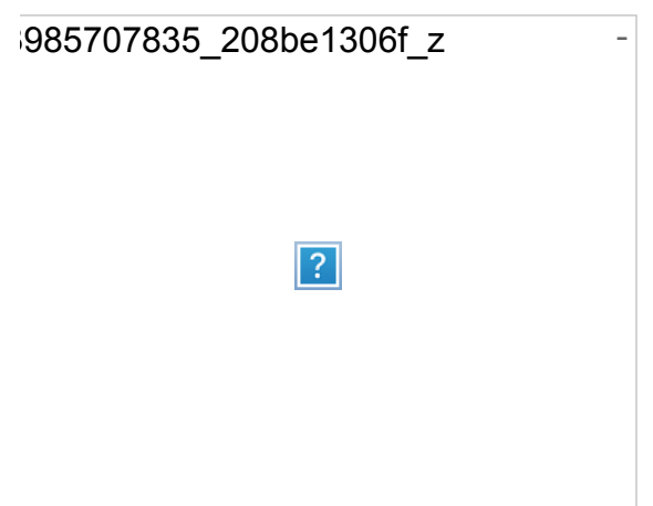
Recipes for Eco-Friendly Carpet Stain Remover