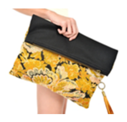
Shop all pretty in pastels